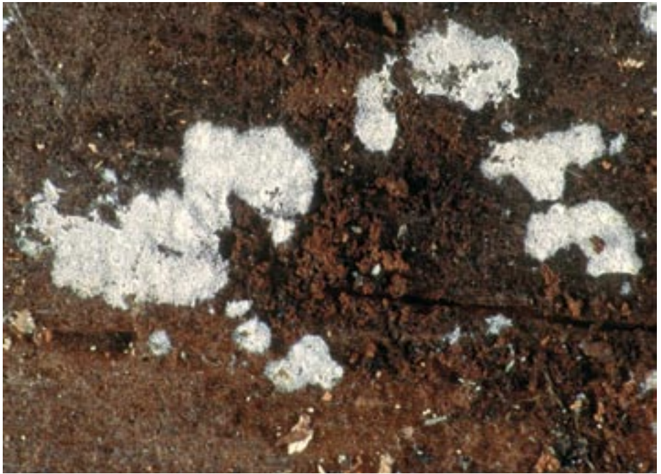
1 ± 1 mm